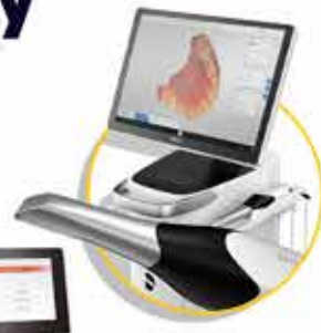
Top Dental Scanner