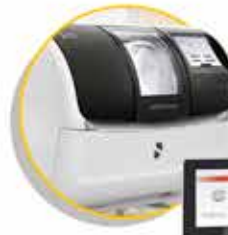
Same Day crowns