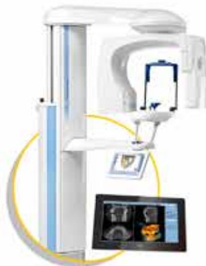
Planmeca ProMax 3D, Panoramic X-Ray, 3D Images