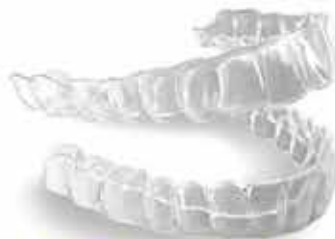
Invisible orthodontic treatment